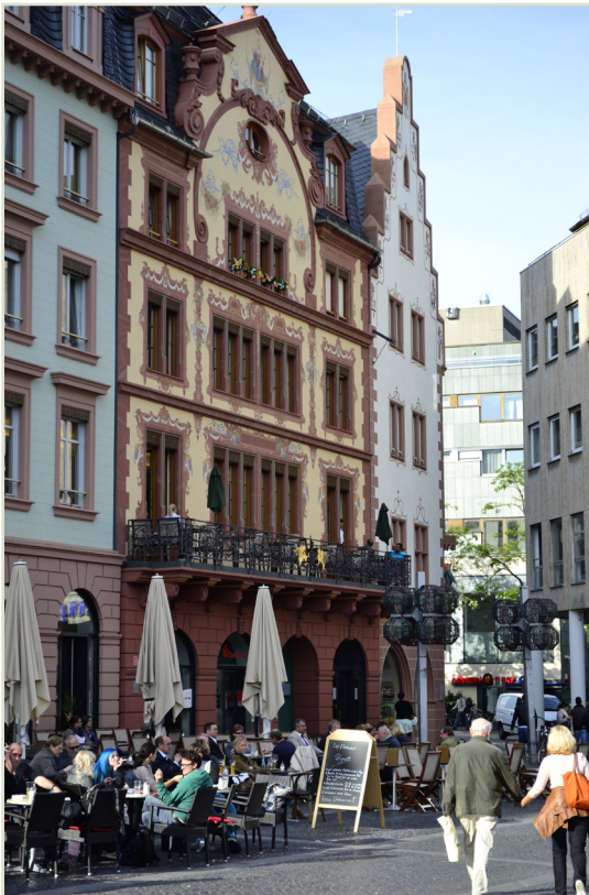
Mainz, Germany

In Benfield’s view, fragmented metropolitan